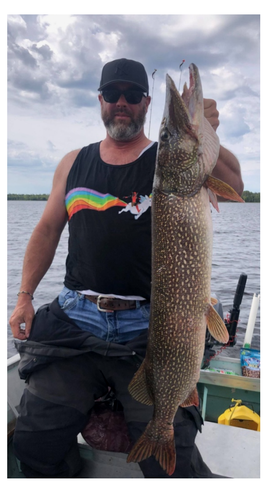
Sky with 42" Northern Pike - 2021