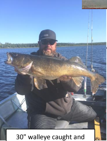
30" walleye caught and released

DRIVE TO ACCESS 30 miles of Adjoining Lakes in Northwestern Ontario's Unspoiled Wilderness! Bluffy Lake was the original pathway of the fur traders and miners in the gold rush era. This vast land provides unsurpassed fishing and hunting.